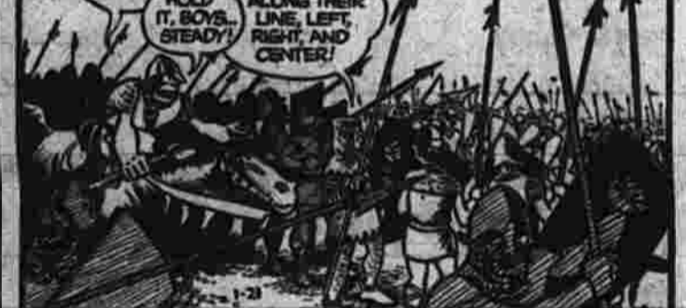
REUNION BY RUSS WINTERBOTHAM